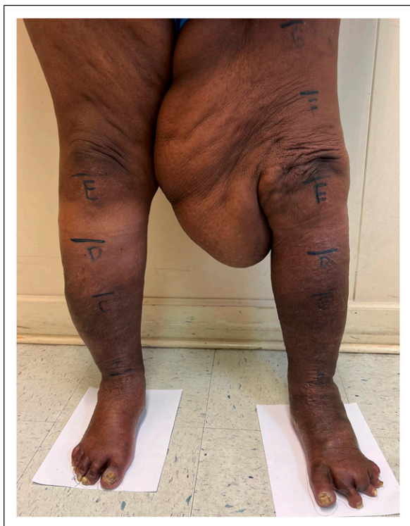
Figure 1. Photograph of a patient with Stage III lymphedema affecting the left leg. Both legs have been marked for circumference measurements for flat knit custom compression stockings at the ankle (B), mid-calf (C), below the knee (D), at the knee (E), mid-thigh (F), and the top of the leg (G).