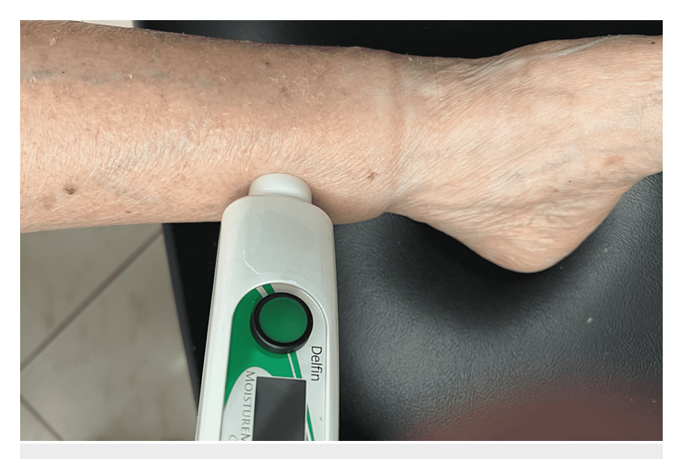
FIGURE 1: TDC Measurement Illustrated

A site on the medial aspect of both legs located 8 cm proximal to the medial malleolus was marked with a skin marker. These sites were the target TDC measurements. After a supine acclimation interval of 10 minutes, TDC was measured in triplicate on both legs with a measurement probe as illustrated in Figure 1. The average of the triplicate measurements was used to characterize the TDC value. The subject remained supine for 60 minutes, after which TDC measurements were repeated. All measurements were made between 1100 and 1300 hours.