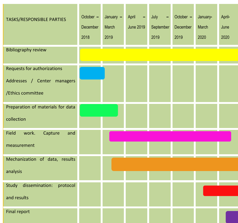
Fig. 2 Gantt's study diagram