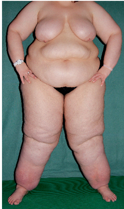
Fig. 5 Patient treated as an outpatient for years due to lipoedema.

There is no scientific evidence that lipoedema takes a progressive course. Rather, it is weight gain and obesity that are very often progressive. The WHO is already talking of