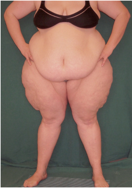
Fig. 2 Patient diagnosed with lipoedema with a severe increase in fatty tissue isolated in the thighs